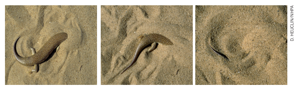
Figure 1 | Going, going, almost gone. Scincus scincus dives head first into the sand.

The theory was inspired by models of tiny aquatic organisms moving in water, where movement is constrained by the viscosity of the fluid. In granular materials, however, it turns out that frictional drag is more important than viscosity, and drag values for short segments of the submerged object are an important input of RFT. One innovation of this work<sup>3</sup> is the use of drag values derived from simulations rather than those laboriously gathered by pulling objects through media of differing density. Using the simulation-derived drag values and kinematics measured from videos, Maladen et al.3 found that RFT predicted the wave efficiency reasonably well, although not perfectly.